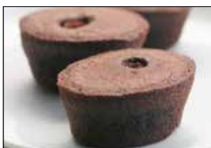
Chocolate Raspberry Friands