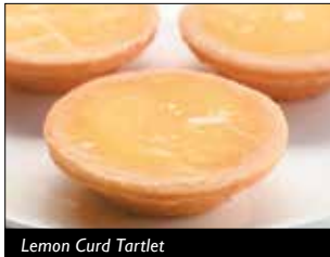
Lemon Curd Tartlet