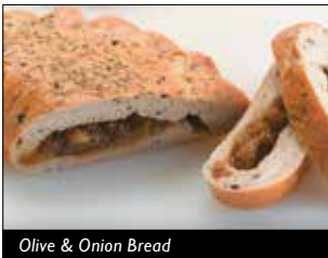
Olive & Onion Bread