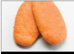
Sundried Tomato Panini