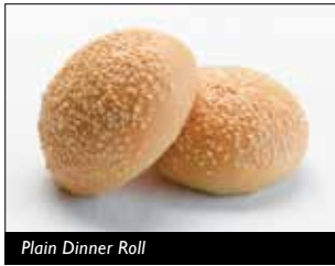
Plain Dinner Roll