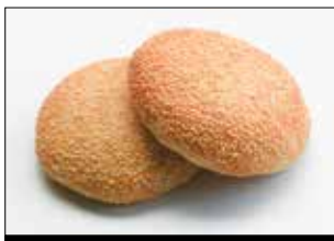
Sesame Flat – Regular, Large