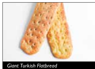
Giant Turkish Flatbread – Cheese, Poppyseed