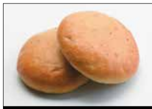
Sage & Onion Flat – Regular, Large