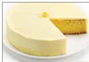
Lemon Madeira Cake