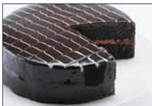
Chocolate Brandy Cake