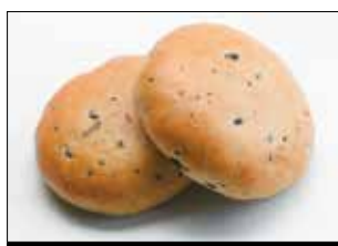
Olive, Pesto Flat – Regular