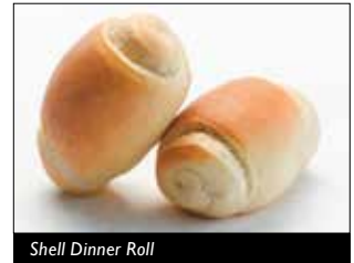
Shell Dinner Roll