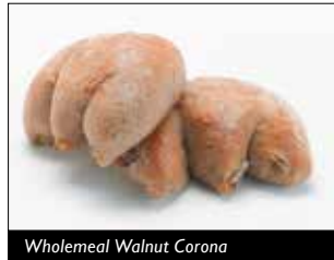
Wholemeal Walnut Corona