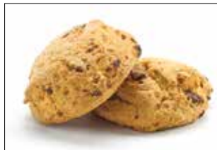
Date & Orange Scone