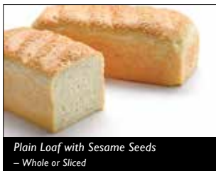
Plain Loaf with Sesame Seeds – Whole or Sliced