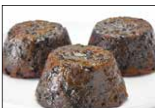
Sticky Date & Chocolate Pudding