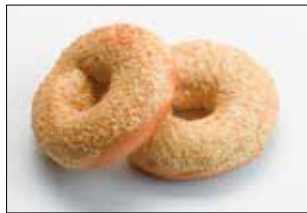
Sesame – Large, Mini