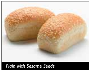
Plain with Sesame Seeds