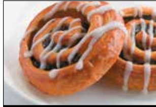
Girelli – Large, Mini