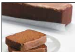
Ginger Loaf (Gluten Free)