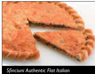
Sfinciuni Authentic Flat Italian

Authentic Artisan – We ensure all the products we produce are authentic and remain true to the artisan style that has been so important in our development.