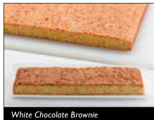
White Chocolate Brownie