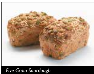
Five Grain Sourdough

Innovation – Our relentless pursuit of new and exciting bakery products of primarily European origin place us at the absolute forefront of the industry. We trial and bring these products to market as quickly as possible.