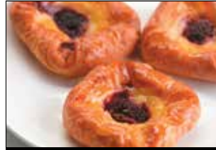
Curd & Boysenberry – Large, Mini