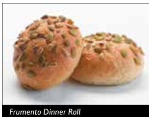
Frumento Dinner Roll