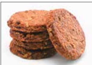
Anzac – Large, Mini