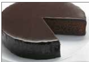
French Chocolate Cake