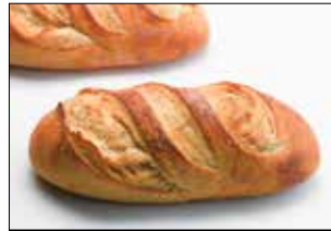
Organic Sourdough Vienna