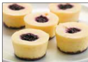
Mini Boysenberry Cheesecake