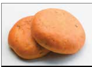
Sundried Tomato Flat – Regular