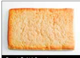
Organic Turkish Focaccia