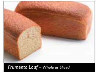
Fruento Loaf – Whole or Sliced