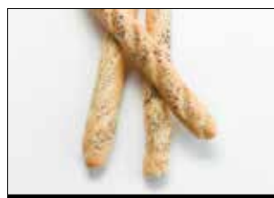
Mix Seed Magro