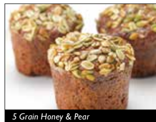
5 Grain Honey & Pear