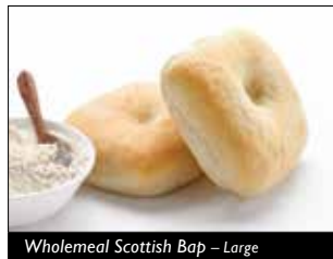
Wholemeal Scottish Bap - Large