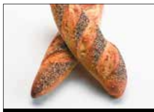
Organic Seeded Sourdough Stick