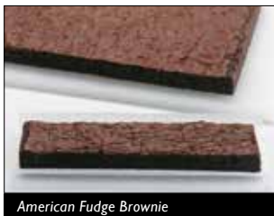
American Fudge Brownie