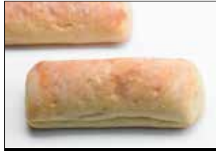
Non-Organic Ciabatta – Large