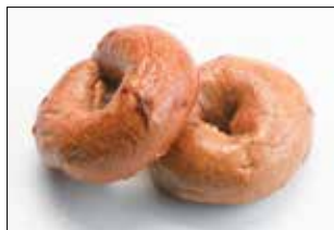
Cinnamon & Raisin