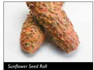
Sunflower Seed Roll