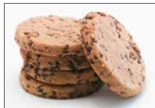
Chocolate Chip – Large, Mini