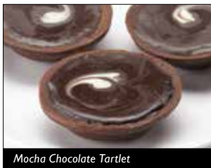
Mocha Chocolate Tartlet