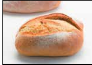
Italian Loaf – Regular, Large (Sliced)