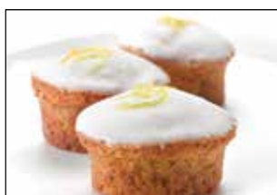
Banana Mini Cake