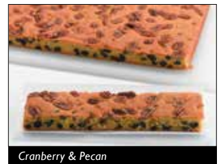
Cranberry & Pecan