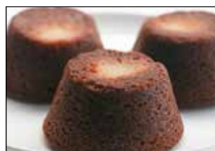
Pear & Ginger Pudding