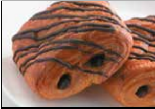
Pain au chocolate – Large, Mini