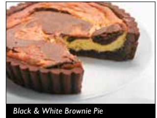
Black & White Brownie Pie