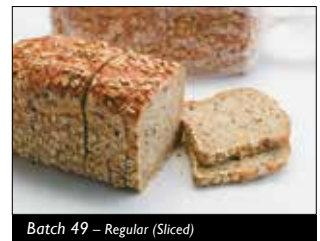
Batch 49 – Regular (Sliced)