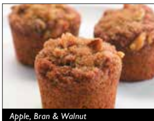
Apple, Bran & Walnut