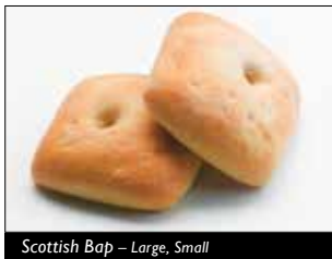
Scottish Bap - Large, Small