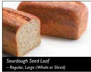
Sourdough Seed Loaf – Regular, Large (Whole or Sliced)