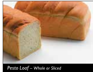
Pesto Loaf – Whole or Sliced