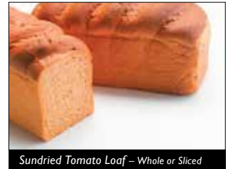
Sundried Tomato Loaf – Whole or Sliced