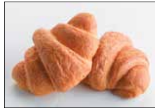
Croissants – Large, Small, Mini