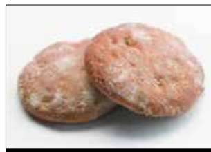
Wholemeal Walnut Flat – Regular