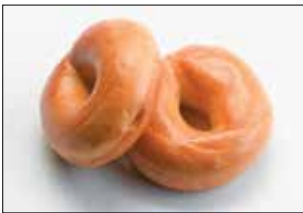
Plain – Large, Mini