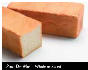
Pain De Mie – Whole or Sliced