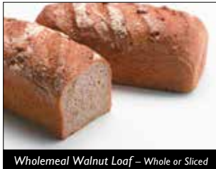
Wholemeal Walnut Loaf – Whole or Sliced