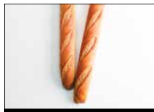
Organic Sourdough Baguette