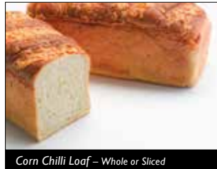
Corn Chilli Loaf – Whole or Sliced