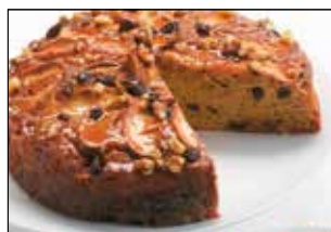
Apple Caramel Cake