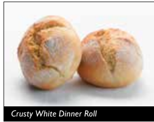
Crusty White Dinner Roll