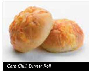
Corn Chilli Dinner Roll