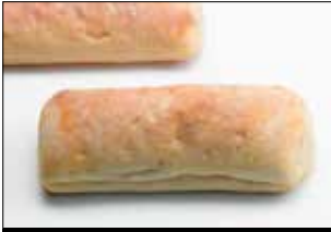
Organic Ciabatta – Small, Large