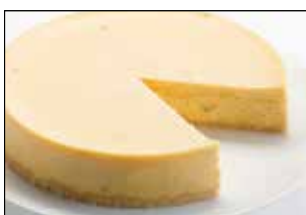
Passionfruit Cheesecake – Large, Mini