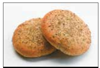
Focaccia Flat – Regular