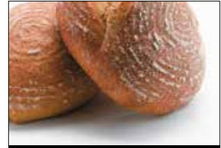
Organic San Francisco Sourdough Boule