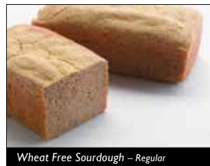
Wheat Free Sourdough – Regular