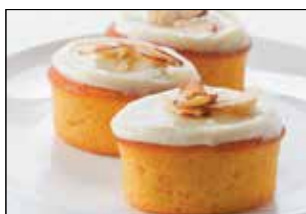
Orange Friands (Gluten Free)