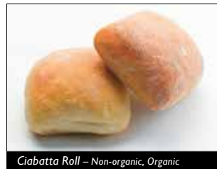
Ciabatta Roll - Non-organic, Organic