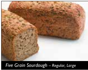
Five Grain Sourdough – Regular, Large