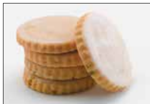
Pistachio Shortbread – Large, Mini