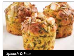
Spinach & Feta