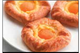
Apricot Danish – Small