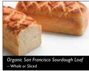
Organic San Francisco Sourdough Loaf – Whole or Sliced