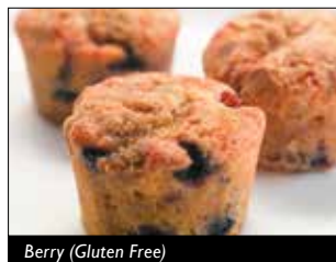
Berry (Gluten Free)