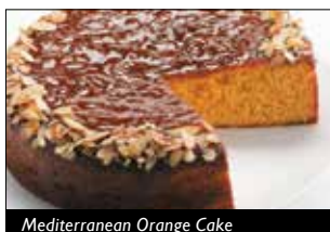
Mediterranean Orange Cake (Gluten Free)