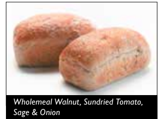
Wholemeal Walnut, Sundried Tomato, Sage & Onion