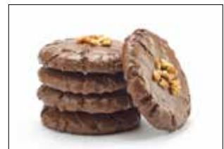
Afghans – Large