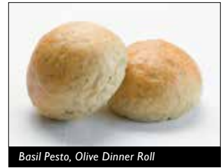
Basil Pesto, Olive Dinner Roll