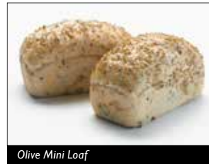
Olive Mini Loaf