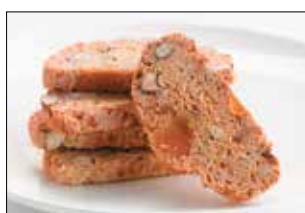
Almond & Ginger