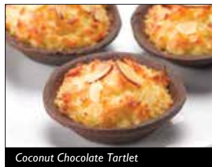
Coconut Chocolate Tartlet