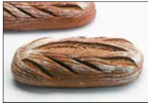
Normandy Rye – Regular, Large