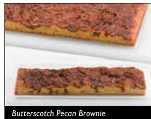
Butterscotch Pecan Brownie