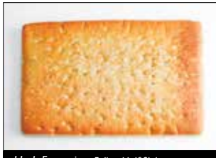
Herb Focaccia – Full or Half Slab