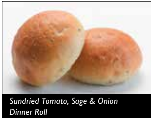
Sundried Tomato, Sage & Onion Dinner Roll