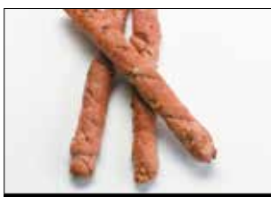
Wholemeal Walnut Magro