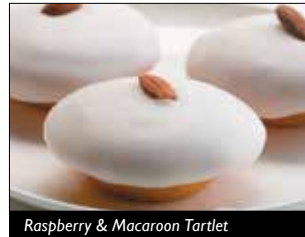
Raspberry & Macaroon Tartlet