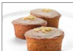
Ginger Mini Cake (Gluten Free)