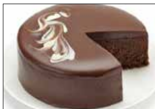
Chocolate Cake (Gluten Free)