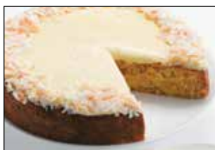
Pineapple & Brazil Cake